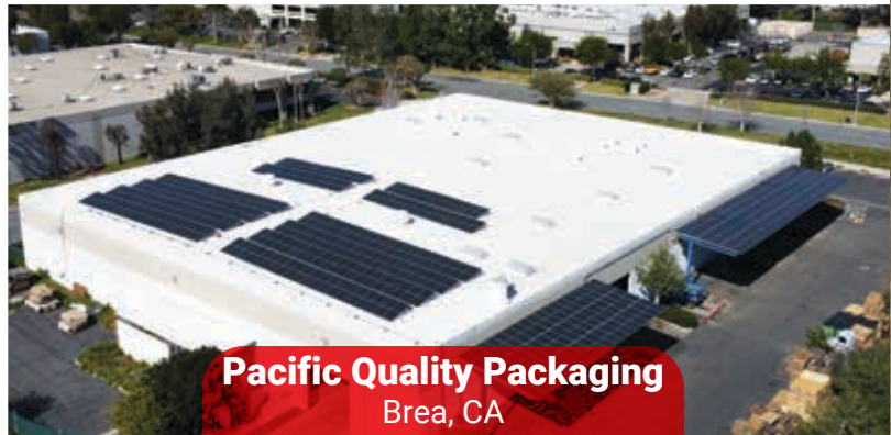
Pacific Quality Packaging Brea, CA