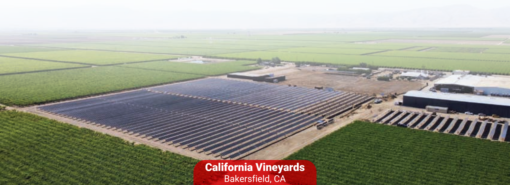
California Vineyards Bakersfield, CA