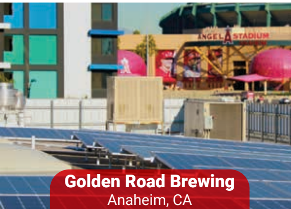
Golden Road Brewing Anaheim, CA