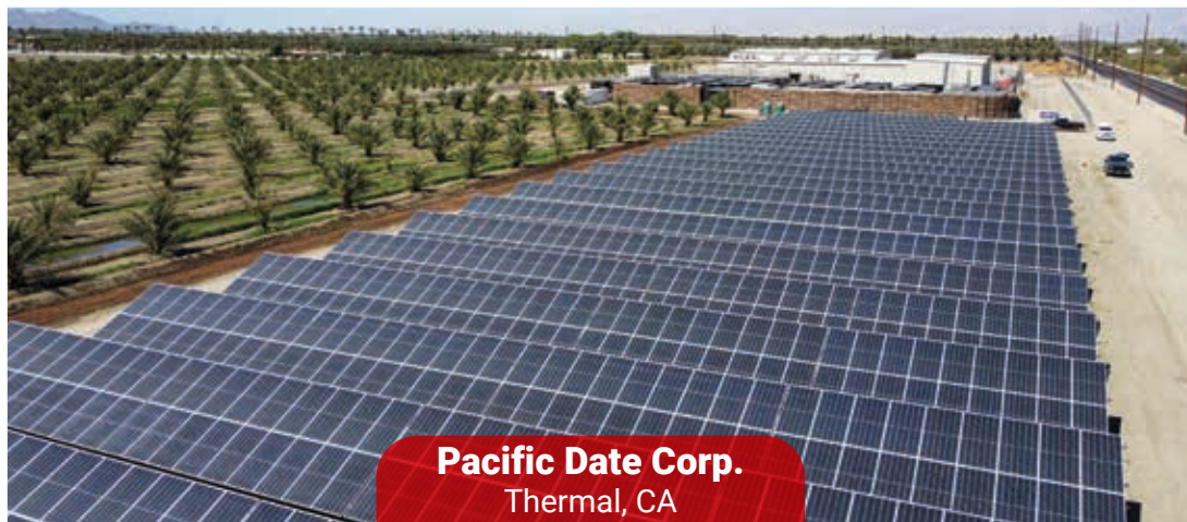
Pacific Date Corp. Thermal, CA