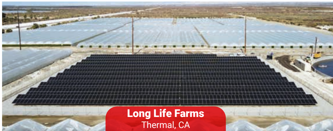
Long Life Farms Thermal, CA