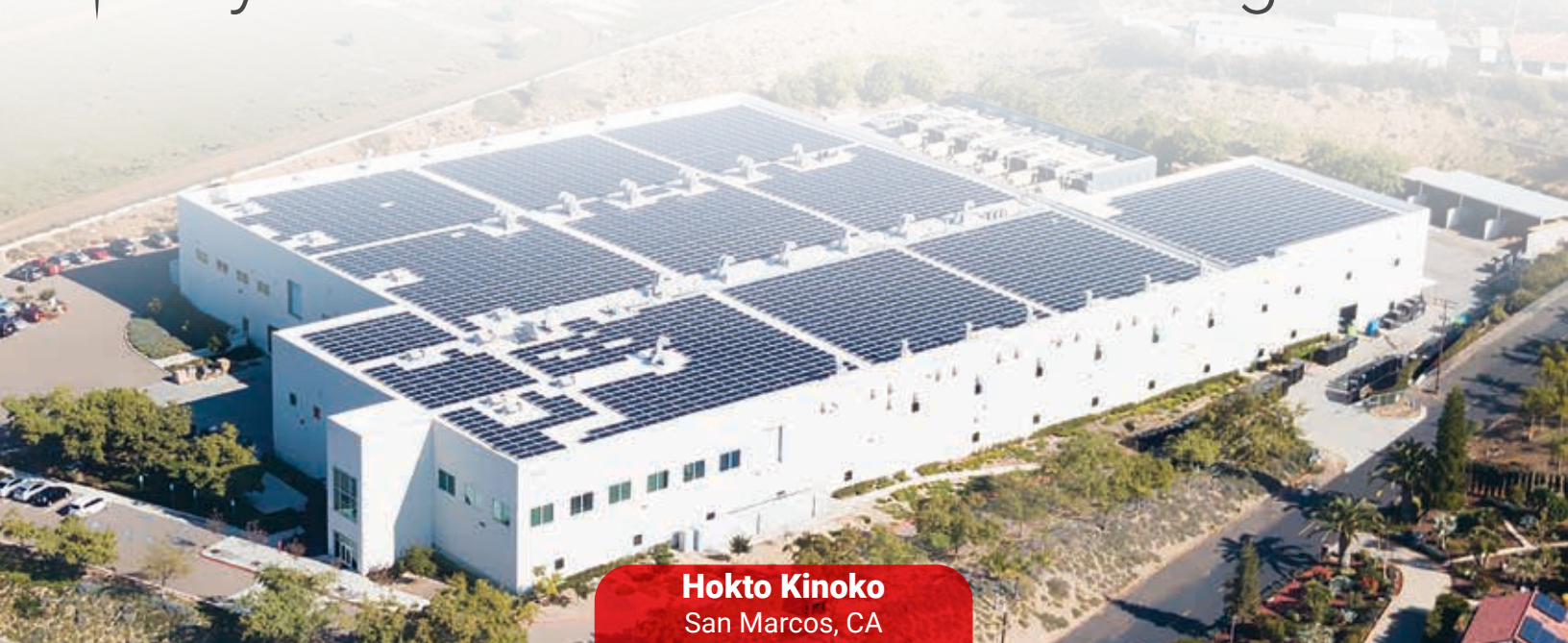
Hokto Kinoko San Marcos, CA