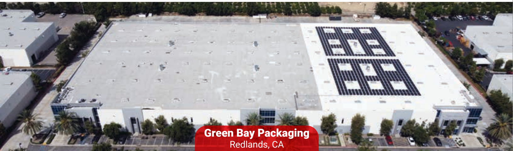
Green Bay Packaging Redlands, CA