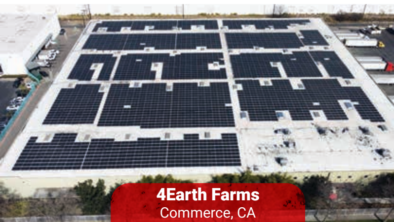
4Earth Farms Commerce, CA