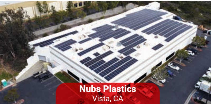
Nubs Plastics Vista, CA