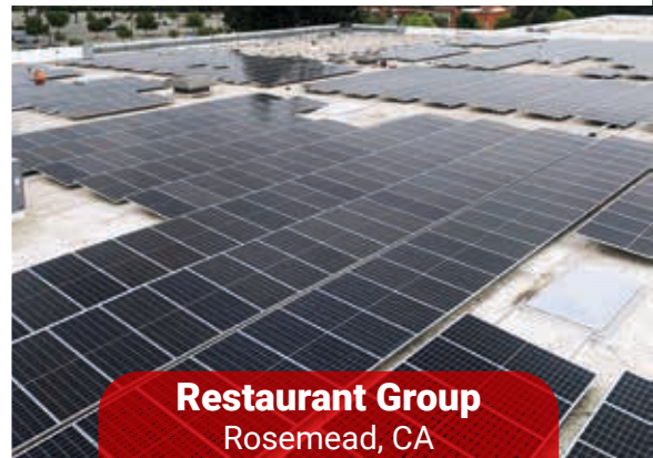
Restaurant Group Rosemead, CA