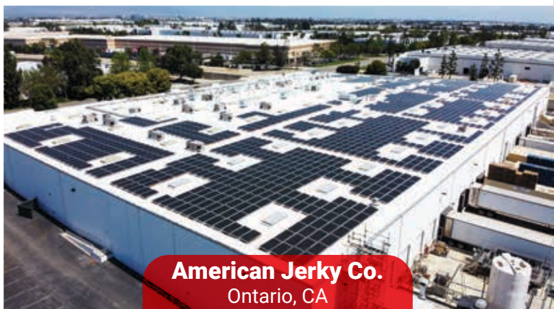
American Jerky Co. Ontario, CA