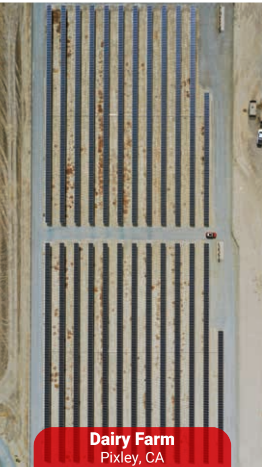
Dairy Farm Pixley, CA