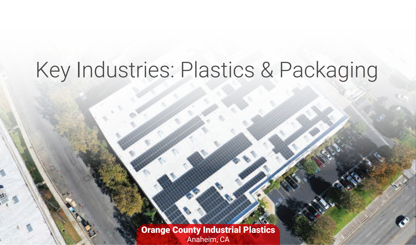
Orange County Industrial Plastics Anaheim, CA