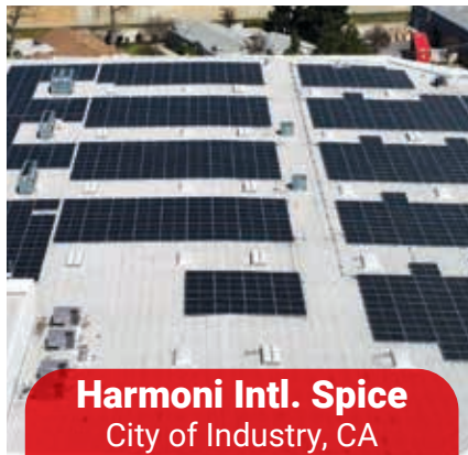
Harmoni Intl. Spice City of Industry, CA