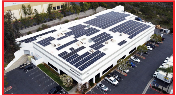
Previous similar size project in Vista, CA

Orange County, CA aerospace and defense manufacturer contracts Revel Energy to develop a 260 kW-DC commercial solar system. The system puts environmental benefits and energy costs savings at the forefront for this industrial business.